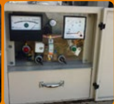
Vacuum breaker / HV tester (up to 50)