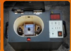
Breakdown voltage tester (Up to 100 kv)