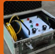
Vacuum breaker / HV tester (up to 50)

Various type from 1000 L/h up to 6000 l/h (total qunuts) complete with high vacuum pump up to 7500 l/h