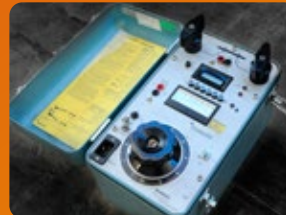
Tahanan (Micro ohm meter)