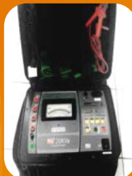
20 KV Insulator Tester